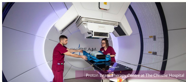
Proton Beam Therapy Centre at The Christie Hospital

been translated to PBT treatment by use of a simple weighting factor. We are uniquely positioned in Manchester with our dedicated PBT research facility including bio lab and PBT radiobiology end station with accurate O 2 control. This capability, with automation, is currently not available anywhere else in the world and puts us at a real advantage in carrying out experiments.